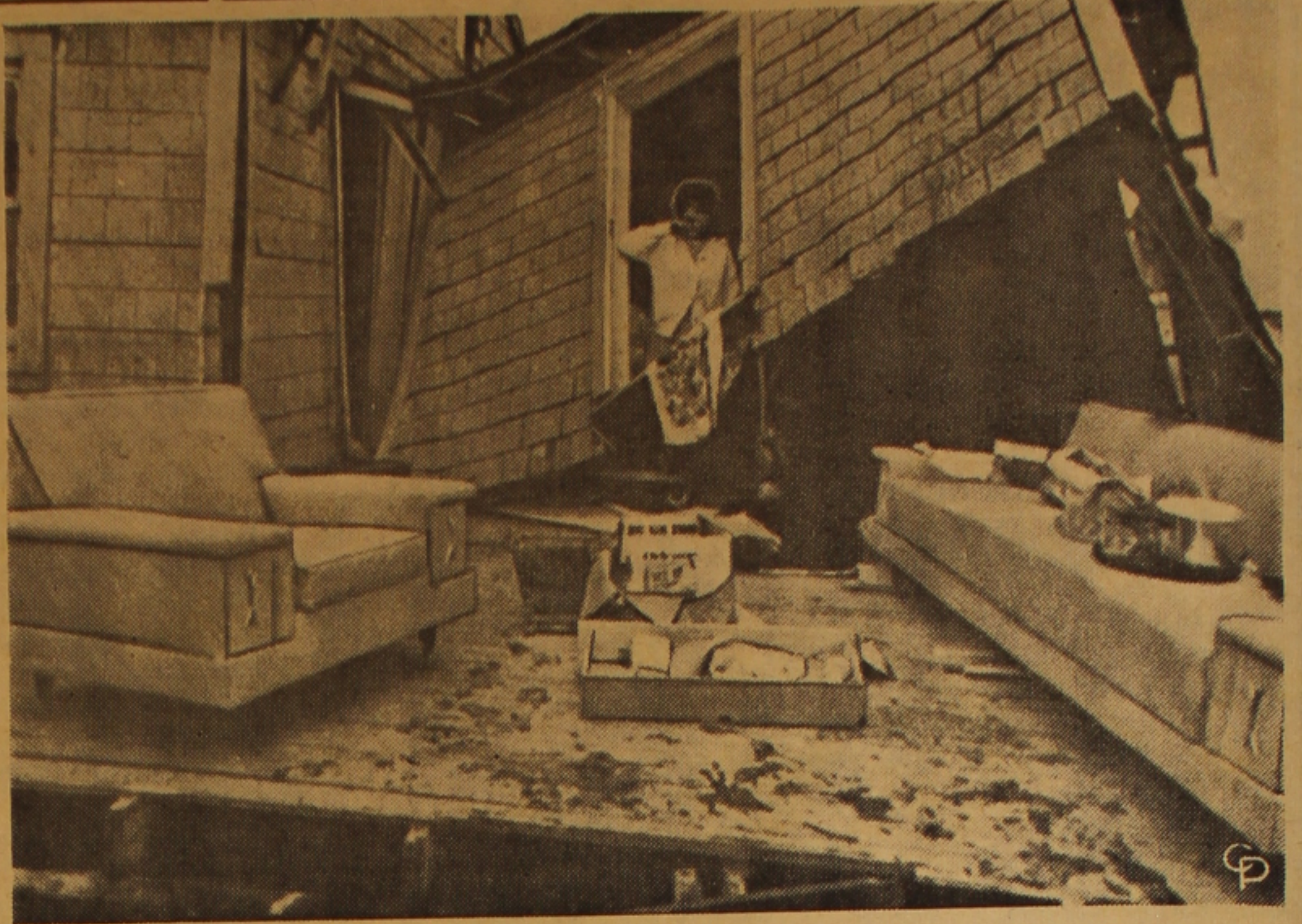
15 CHILDREN UNINJURED—This house, in ruins in Opelousas, La., was moved 25 feet off its foundation by tornadic winds, but 15 children inside came through uninjured.